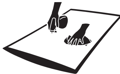
Always keep your FloorWindo® clean