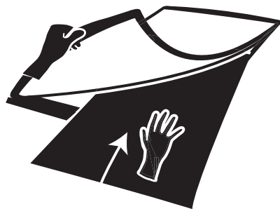
Exchange the poster like this