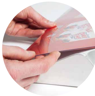
Update graphics quickly and easily Model shown: B-Line™ 2