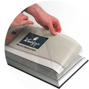
Update graphics quickly and easily Model shown: B-Line™ 1