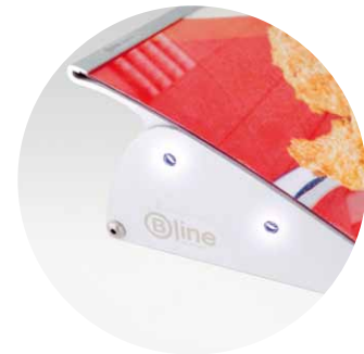
Optional LED lighting for even more impact